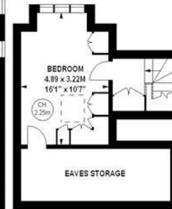
213 sq ft Second Floor