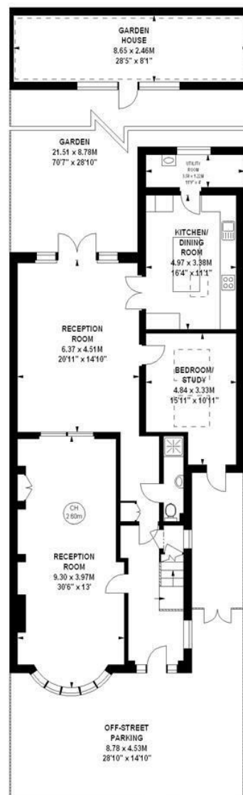
1306 sq ft Ground Floor

Eaves Storage 11.33 sq m / 122 sq ft Garden House 21.37 sq m / 230 sq ft